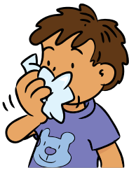
after you cough, sneeze or blow your nose