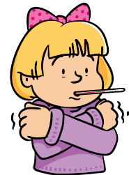
after you've touched someone sick