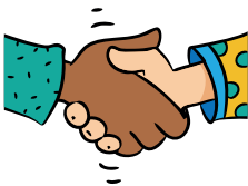
after you shake hands