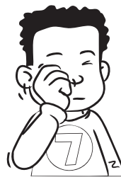
before you touch your face