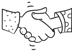
after you shake hands