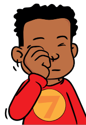
before you touch your face