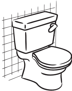
after using the bathroom