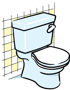
after using the bathroom