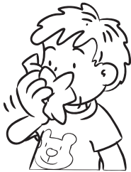
after you cough, sneeze or blow your nose