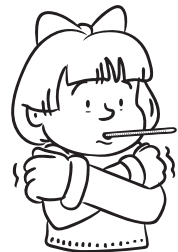
after you've touched someone sick